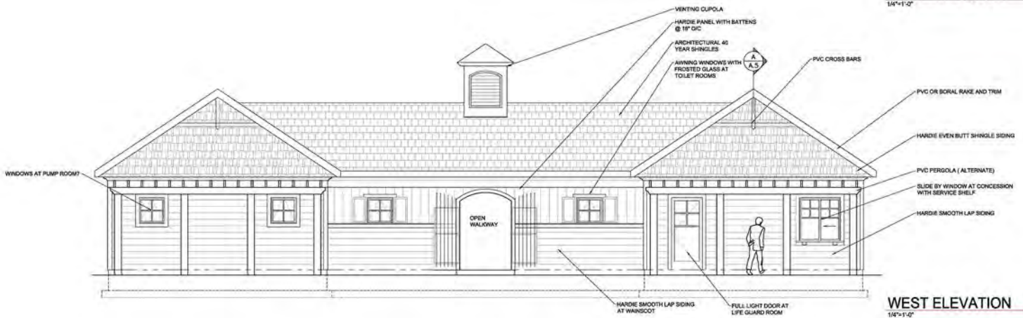
WEST ELEVATION 1/4"=1'-0"

Please check your chosen level of sponsorship on the other side of this form. For more information, contact Urbanna, Virginia's Town Hall Office at (804) 758-2613. Or stop by at 390 Virginia Street, Suite B, Urbanna, Virginia 23175