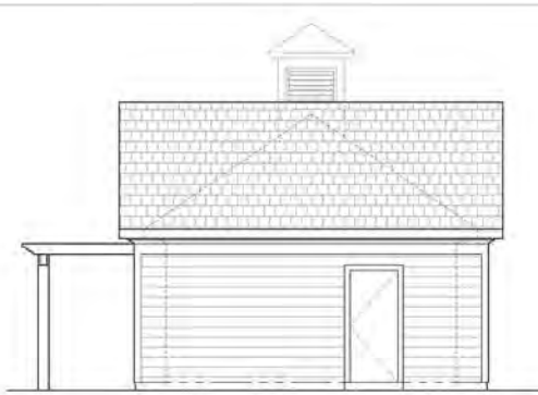
SOUTH ELEVATION 1/4"=1'-0"